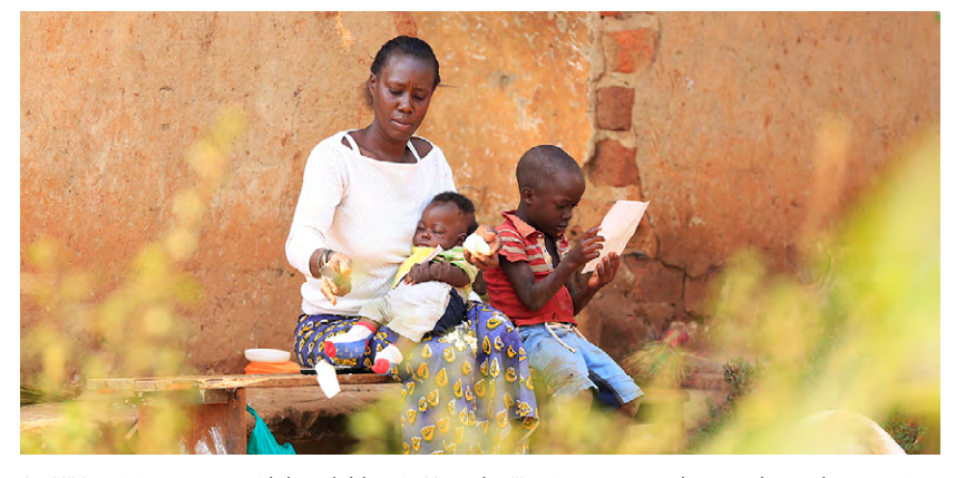
An HIV-positive woman with her children in Uganda: "It gives me great hope to know that creating awareness will eventually help us make sure that children in Africa are no longer born with HIV."

Sharing Denmark's focus on gender equality, UNAIDS actively engages with international bodies such as the Human Rights Council and the Commission on the Status of Women to ensure that HIV-related rights—particularly of those left behind in the HIV response, such as key populations and women and girls—remain high on the political and development agendas. UNAIDS works with governments on resolutions and organizes and participates in high-level side events to ensure policies and commitments promote access to prevention and treatment services without discrimination.